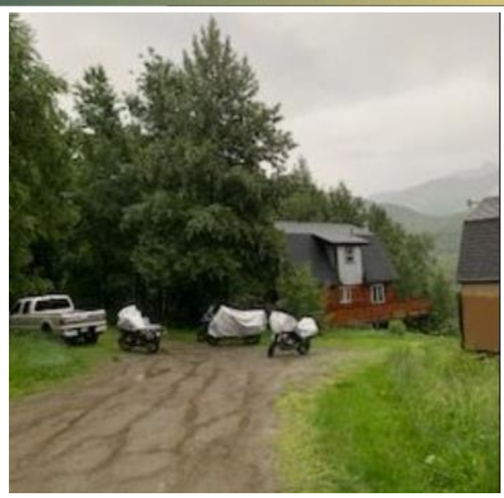
h us on the Web at WWW.RCB.ORG

On Day 10 we headed back home, and it was a 500-mile day to Haines Junction. Again, we're back on the Alaskan Hwy but this time there was less traffic, no rain, nice & sunny so the gravel road was dry a little dusty but easier to ride this time. Yippee! We rode into town at 11 pm and it was still daylight.