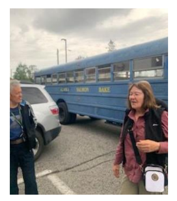
RCB Newsletter Page 11 of 23

In Fairbanks was the "Alaska Salmon Bake" a rickety blue school bus ride picking up tourists at hotels to a venue enjoying their mother lode salmon with other yummy fish and fixings.