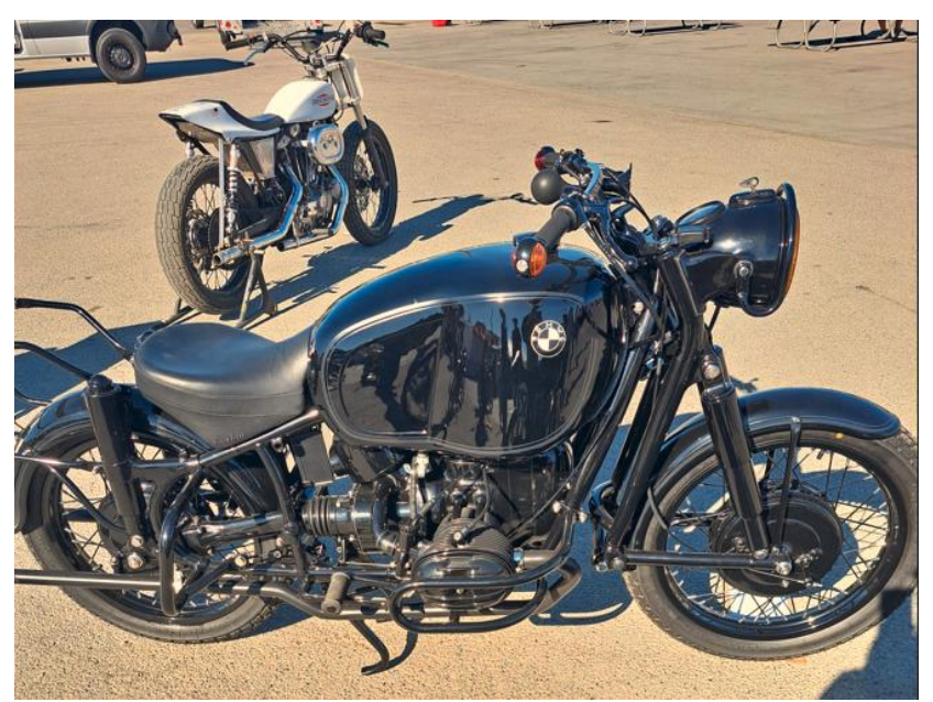
Not sure what this is.