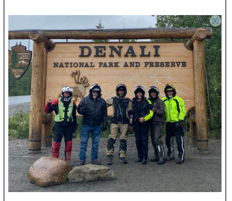
Teasers for next month.