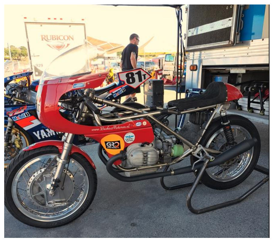
All custom made in Holland. The engine is a 500cc - 50's / 60's vintage. Work of art.