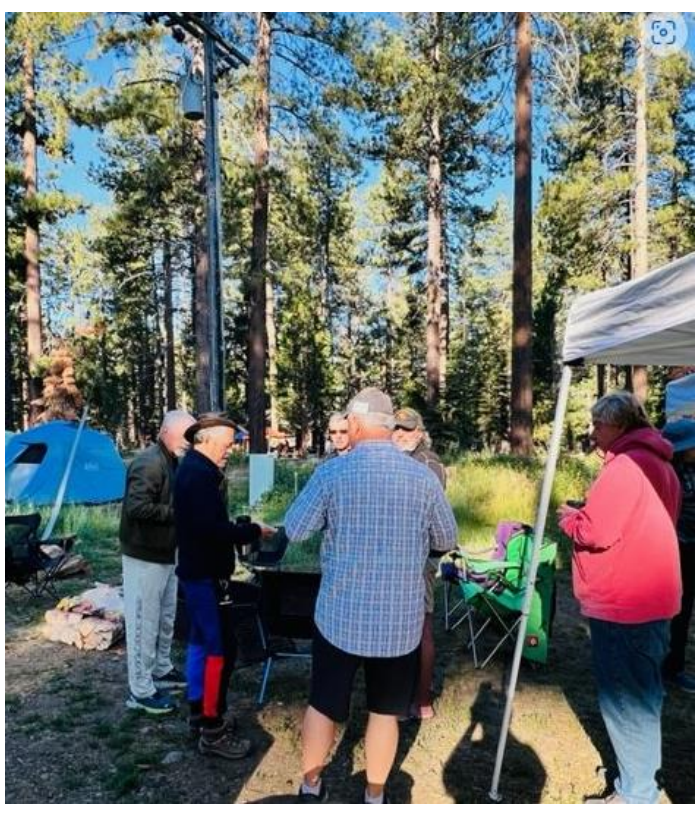
RCB Newsletter Page 11 of 17