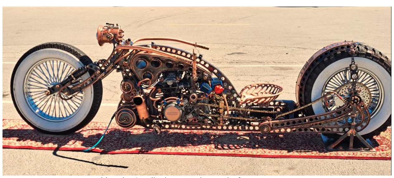
Honda 4 cylinder mostly made from copper.