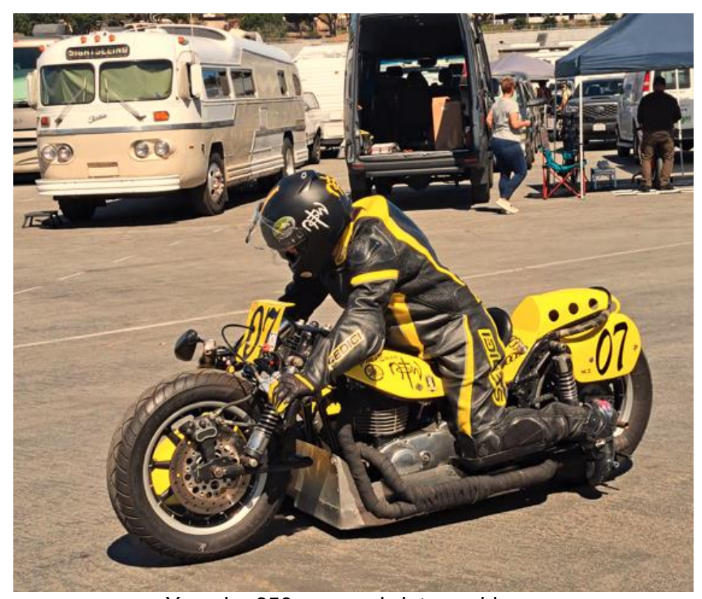
Yamaha 650 powered vintage sidecar