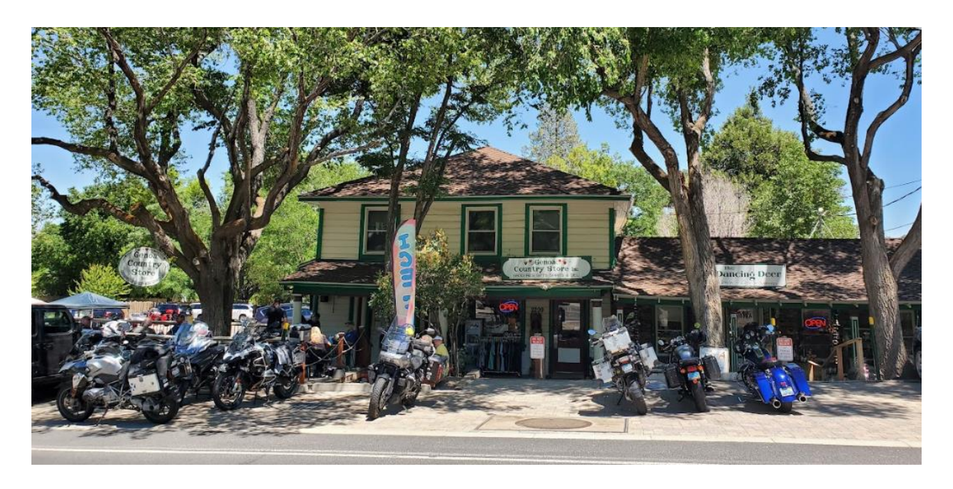
Genoa deli for lunch.

Those going bowling ride from Genoa to Yerrington, Nevada.