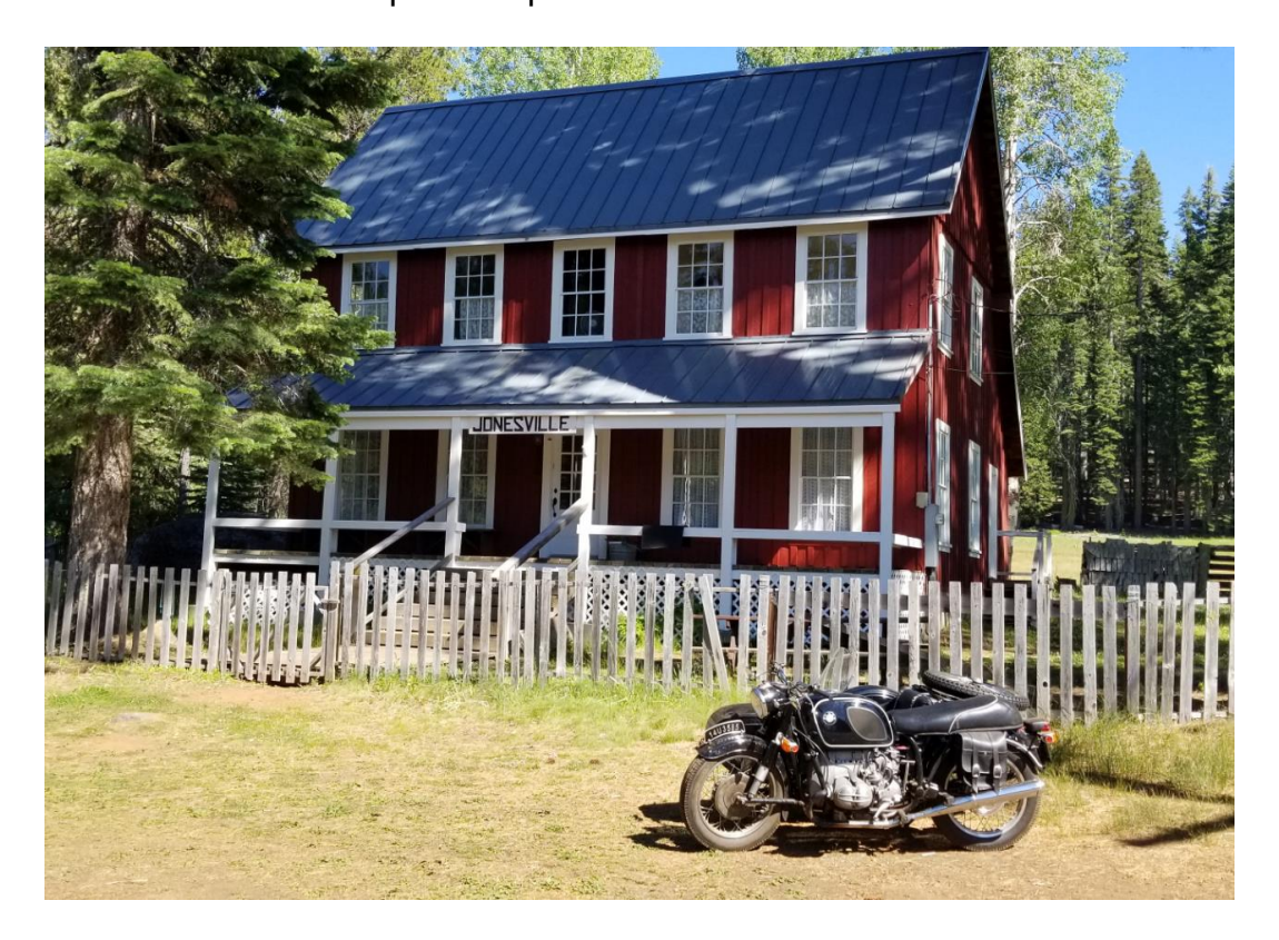
Visit to the old Jonesville Hotel near Butte Meadows (hopefully not destroyed by the Dixie Fire)