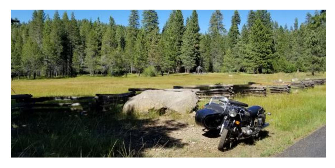
Pitstop at an open meadow near Jonesville