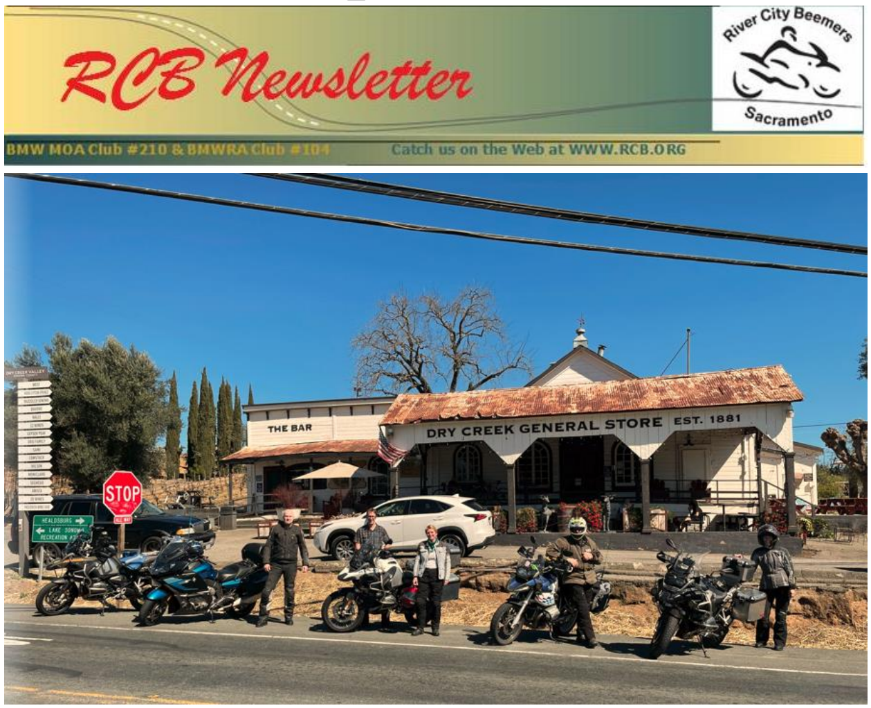
Friday lunch at the Dry Creek General Store, Cloverdale

At our lunch stop, the Dry Creek General Store, I proposed to our group of very talented, seasoned veteran riders a route option. It adds approximately an hour to take Stewarts Point-Skaggs Springs Rd. over to Hwy. 1, coming out at Sea Ranch. But with the nearly perfect weather this would be the time to pick this as an optional route to Mendocino. Everyone was a go and we were rewarded with only encountering 3 logging trucks & a few cagers. The pavement was much better than I last recall and we all enjoyed the wonderful scenery that route provides.