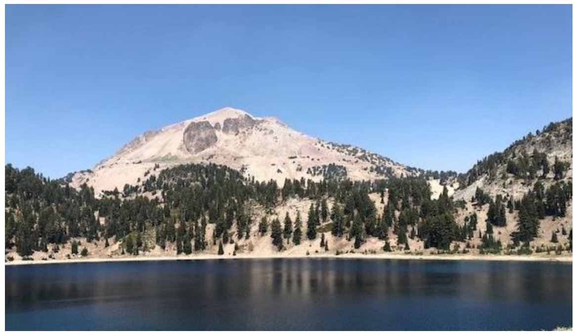
RCB Newsletter Page 11 of 17