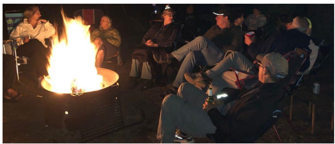
RCB Newsletter Page 9 of 17