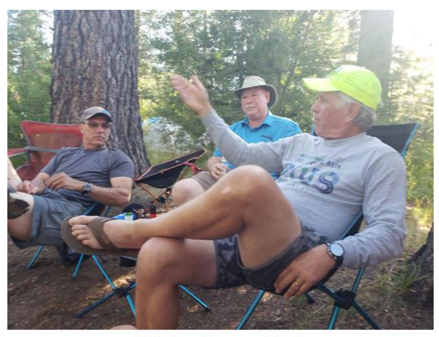
VP Gordy proclaiming something.

Many thanks to Gordy for keeping track of the first opportunity to reserve the camp sites. We might not have a Tahoe Chill if we miss the start of reservations by even a few hours.