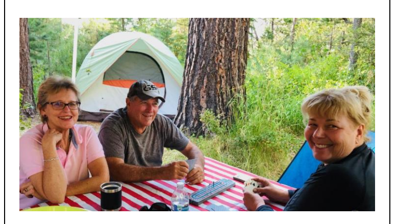
Cribbage at Tahoe Chill

The RCB board of directors meets monthly to review past activities and plan future events, taking into consideration member interest and cost. The meeting is open to all. While the meeting begins at 7:00 P.M., most directors gather earlier to have dinner.