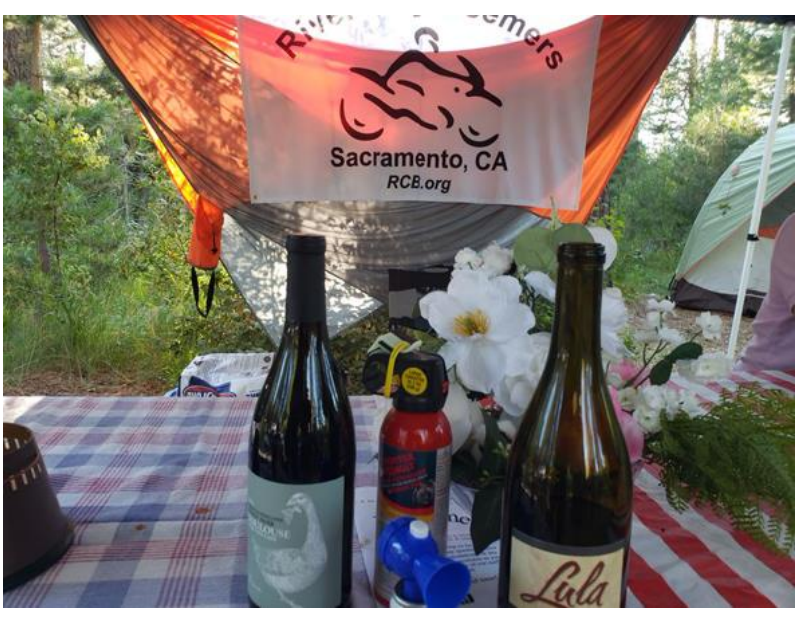
RCB Newsletter Page 6 of 17