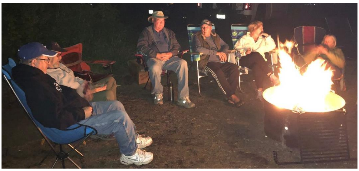
RCB Newsletter Page 8 of 17