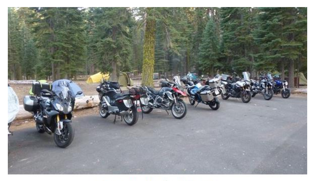
RCB Lassen Lost Creek Camping 2018

The camp site at the Lost Creek Group Campground for future reference.