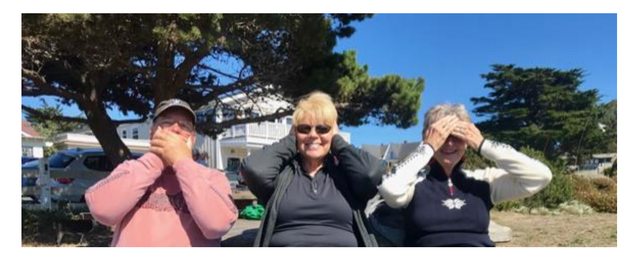
RCB Newsletter Page 7 of 12