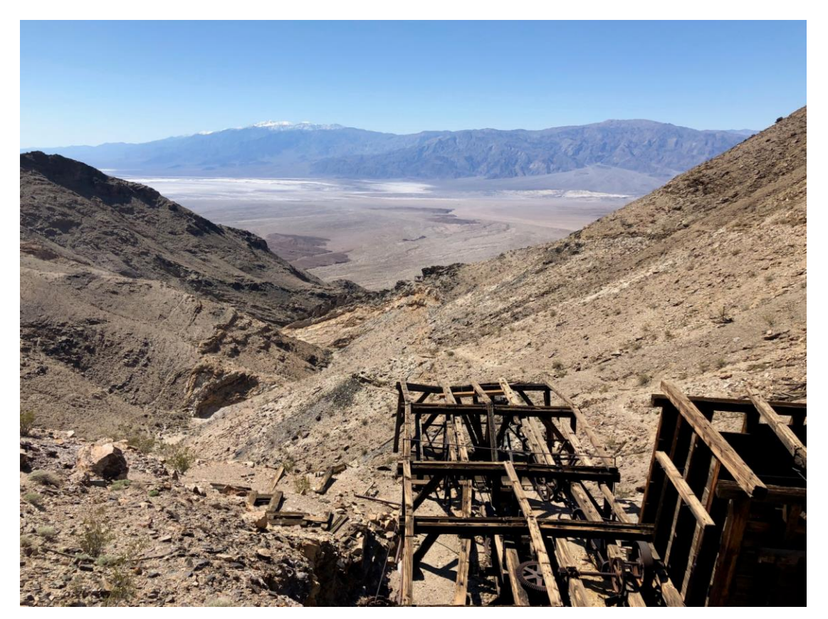
Top of the Tram Looking Down to Death Valley