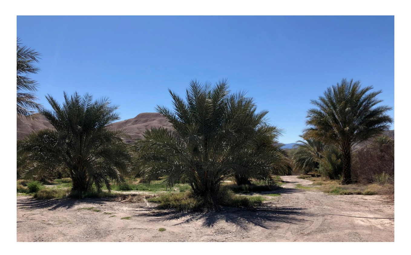
Date Palms at China Ranch

We also rode to China Ranch, a date farm, near Tecopa Hot Springs for a date shake.