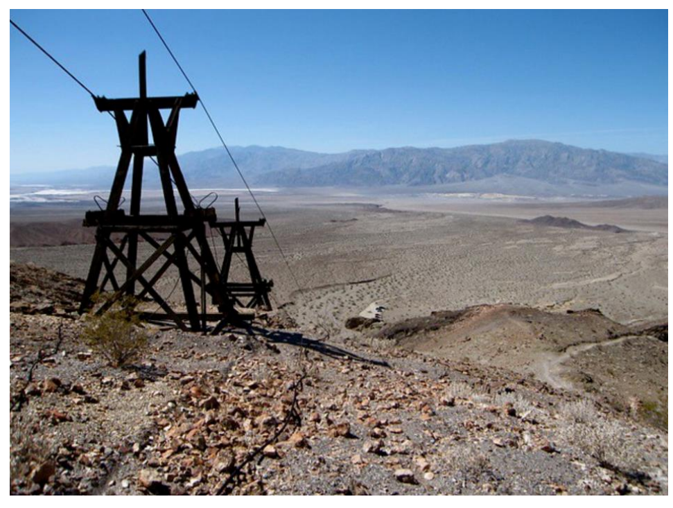
RCB Newsletter Page 9 of 17

By 1912, the value of the Keane Wonder Mine ebbed with a lack of raw material to continue mining profitably, and by 1942 the last attempt to continue operations came to a close. From 2008 to 2017, the area was closed for structural stabilization, mine mitigation and soil sampling. The preserved structures at Keane Wonder inspire us to imagine the miners who walked these same trails in search of a different value in the landscape.