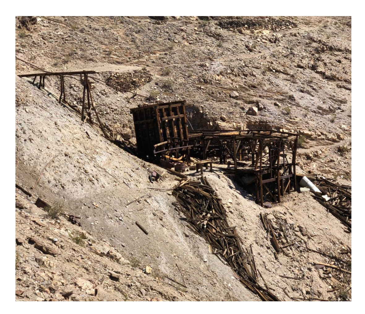
The Top of the Aerial Tram