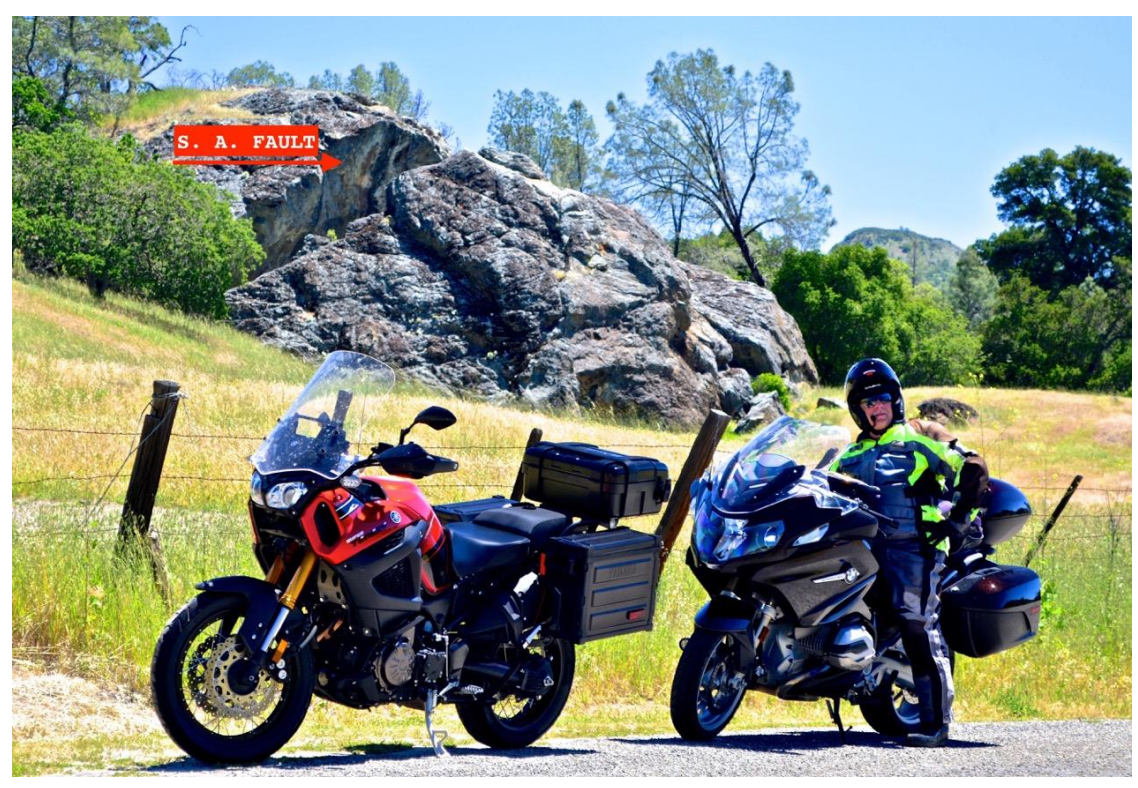
On Peach Tree Road to Hwy 25 heading up towards Hollister. At one point in the ride you cross over the San Andreas Fault where there is a hugh rock formation that was split in half because of the fault.