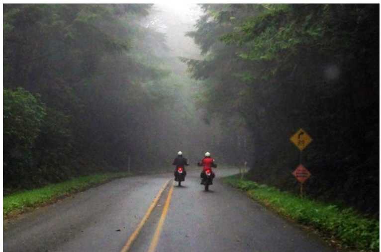
Try to anticipate dangerous and uncomfortable situations before they occur.

If she's not comfortable with her gear or the motorcycle itself, riding can become a real burden. It's important that she has a bike that fits her and gear that provides good protection. As a new off-road rider, she may feel uneasy behind the handlebars at first. Try to anticipate dangerous and uncomfortable situations before they occur. Remind her of important steps and motivate her to become a better adventure rider. You should also encourage her to experience trails outside of her comfort zone. If she reaches an obstacle that she's not ready to overcome, offer to take her bike through it for her (this has helped me a lot). Don't judge her. Don't tease her, even if that's how you normally show affection. Pushing her too hard could discourage her and make her never want to try again, but don't be too gentle or it could harm her ability to learn. Whatever you do, make sure she is comfortable and confident behind the bars before setting off on your big adventure.