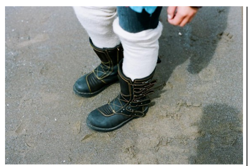
Style matters. Show her where she can find gear that is both fashionable and practical.