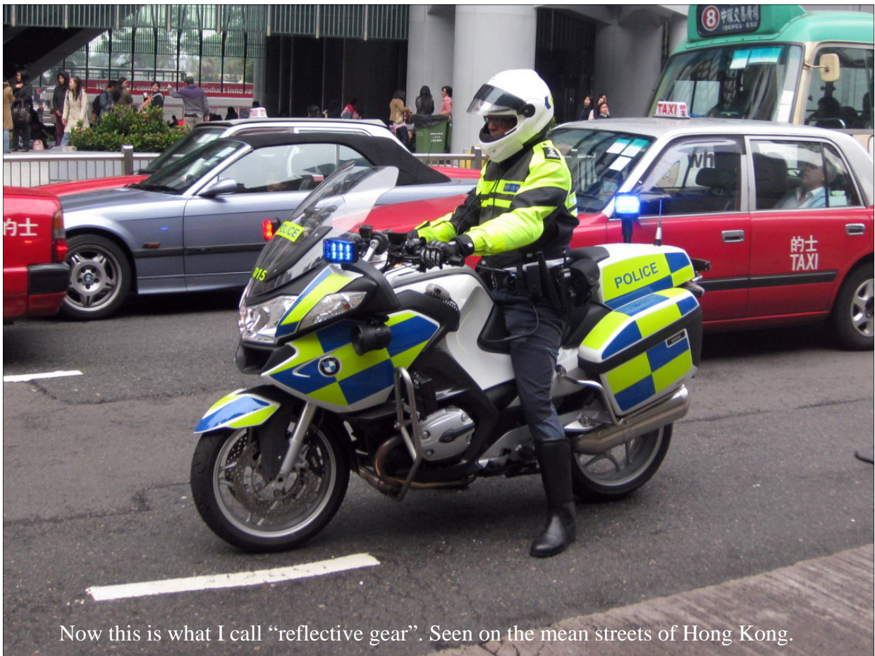
Now this is what I call "reflective gear". Seen on the mean streets of Hong Kong.

just know that the bowling starts at 5pm. Call Casino West at 800-227-4661 and ask for Kelly. Even if the hotel is sold out it is worth riding to Yerington and see if any of the rooms are available. There have always been some rooms available for last second check in. There are also a few motels near Casino West in case plan B is necessary. See you there!