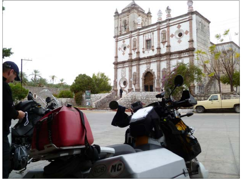
Getting religion south of the border in San Ignacio, Baja Sur, MX

River City Beemers, Inc. PO Box 2356 Fair Oaks, CA 95628 www.rcb.org