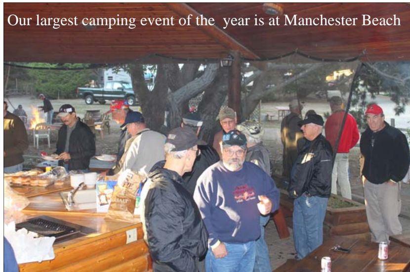
Our largest camping event of the year is at Manchester Beach

None of these events happened by themselves. One