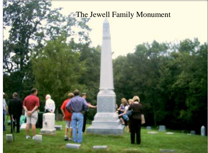
The Jewell Family Monument

A short jaunt up I-76 to North Platte, NE and we turned off the interstate to follow secondary roads through Nebraska to our next stop in Yankton, S.D. Northern Nebraska is quite a bit different from what you might expect; there are rolling hills, streams, cattle, and some of the most picturesque farm homes and ranches I've ever seen. The miles and miles of corn begin a little ways east and then it never seems to end. A menacing looking thunderstorm was follow-