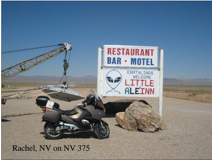
Rachel, NV on NV 375