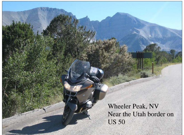
Wheeler Peak, NV Near the Utah border on US 50

I rode down the main drag admiring the costumes and booths