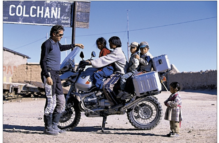
Somewhere in Latin America

1985 Honda XL350R dualsport 7000+ miles, $1895. Call Alan 916-203-4032, 916-421-4032 e-mail alanretired@sbcglobal.net (4/20)