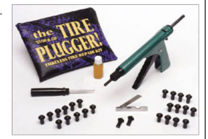
pecially the one with the "gun": http://www.ascycles.com/detail.aspx?ID=2082

I used to use Stop & Go kits, but I've found that the plugs in those kits will sometimes fail when they get cut by the steel cords in radial tires. In addition, the Stop & Go systems are much bulkier,