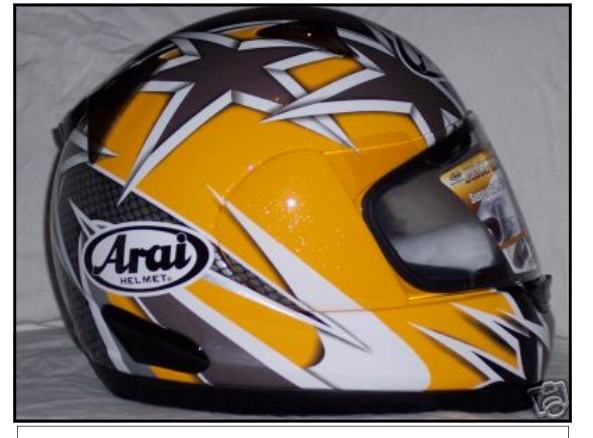
The latest Arai Profile helmet. It replaces the old Signet GT, but now uses the same face shield as the Quantum and Corsair Rx-7 models. That means that all new Arai street helmets use the same shield!

2004 R1100S, Silver/Yellow, 13K Miles, Sports Edition, Fully Serviced, and Remainder of Factory Warranty (14 months). Call Dorne at 916-717-7190. $8950 (8/12)