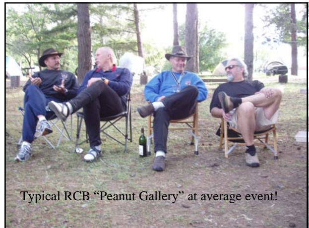
Typical RCB "Peanut Gallery" at average event!

Jun 23-25 Indian Creek Spaghetti Feed/Campout, details TBA.