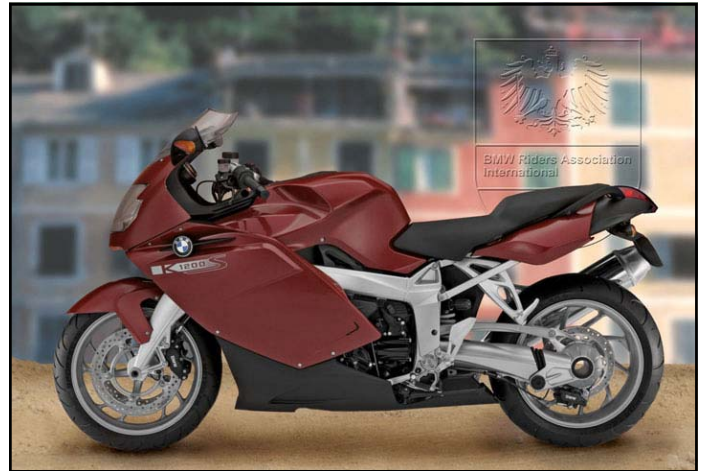
The new 2005 K1200S as seen on the BMWRA web site.

Women's motorcycle gloves , never used. BMW airflow size 6-6.5 paid $ 80.00/ sell$40.00. Olympian kevlar gloves size 5-6 paid $70.00 sell $35.00. $ 70.00 for both. Call Dave 530-878-6460 (1/4)