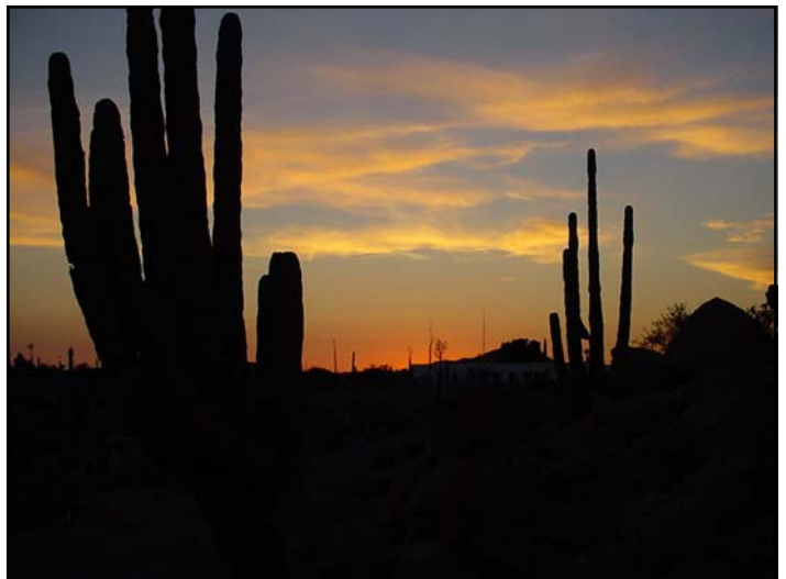
Sunset 300 miles below San Diego at Catavina, Baja, Mexico

2001 BMW R1100S , ABS, Yel/blk, S.African LE, 9k, htd grps, acc outlet, cruise, Two Bros exh, lower pegs, recent tires, warr 04/04. This edition (1 of 200) comes with higher bars, taller w/s, c-stand, cancel signals, nice bike, 18k invested. First $12k. Cafe Mike (530)527-5159, mrh@tco.net (12/10)