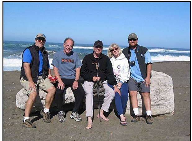
Happy campers from the 2002 Manchester campout