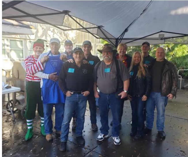
The Crew at the Children's Receiving Home Christmas Spirit

The RCB board of directors meets monthly to review past activities and plan future events. Consideration is given to member interest and cost, and the meeting is open to all. While the meeting begins at 7:00 P.M., most of the directors gather earlier to have dinner.