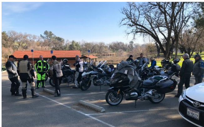
Rest Stop Near Lake Berryessa